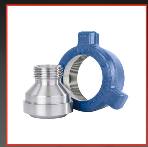
REPAIR KITS - STANDARD & NACE