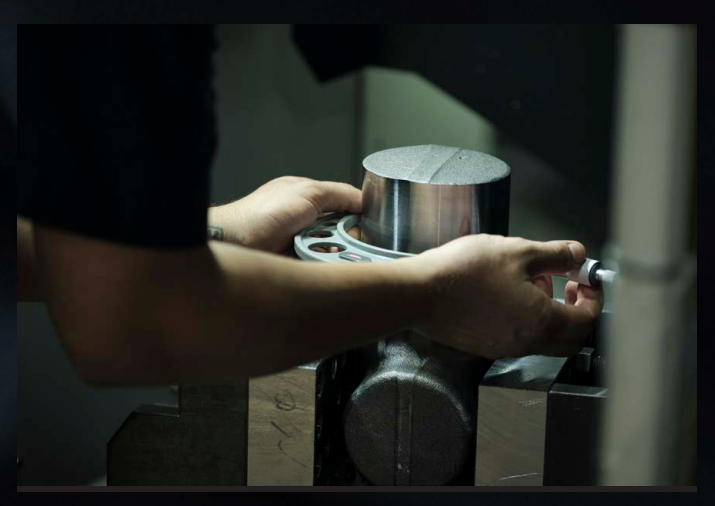
PRECISION MEASUREMENTS OF EVERY PRODUCT