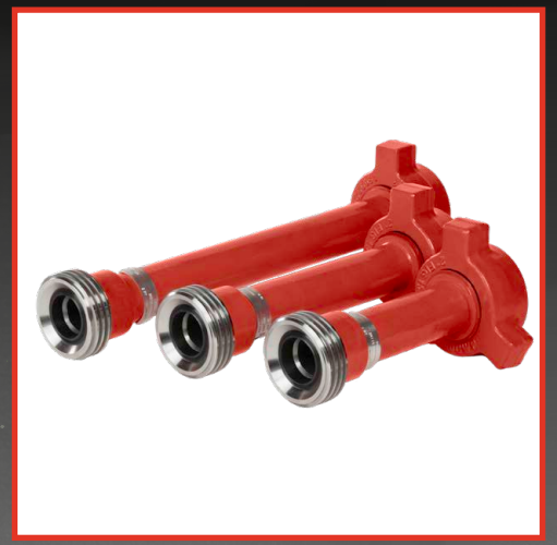
CODE RED SWIVEL JOINTS