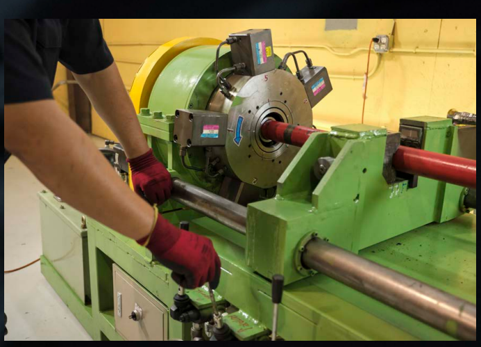
CUSTOM MADE BUCKING UNIT