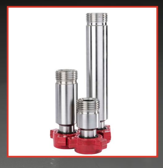
UNION SWAGES & ADAPTERS