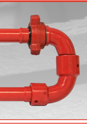
MADE IN THE USA