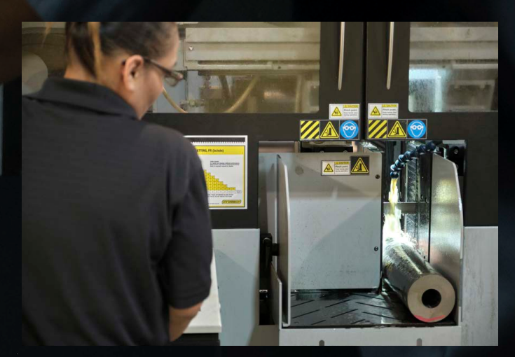
HIGH PRECISION PRODUCTION

Quality and precision says it all. Cactus Flow Control has purchased some of the newest and technologically advanced machines available. From our state of the art saws to our new Puma Vertical Lathe, at Cactus you'll find nothing but quality. Every product is machined highest level precision and accuracy.