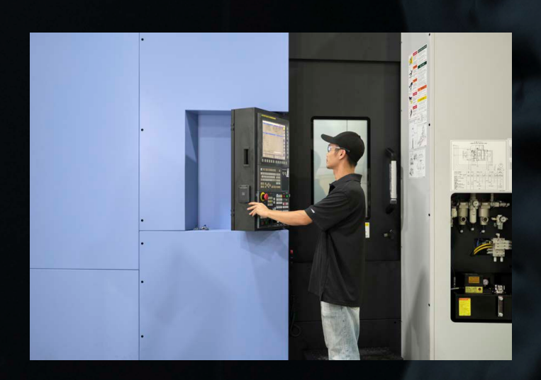
STATE OF THE ART DOOSAN VERTICAL MILL